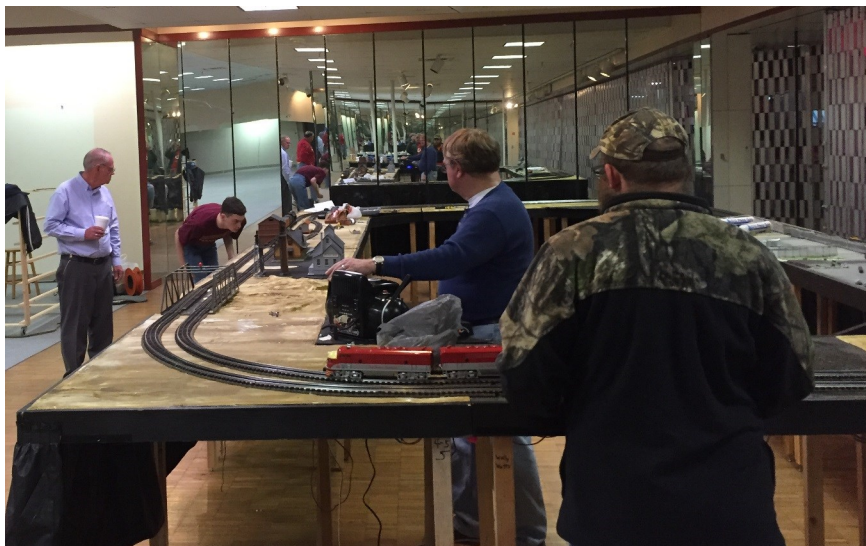
One more shot of the modular layout at Madison Square Mall