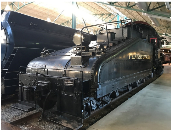
Railway Museum of Pennsylvania, Strasburg, PA