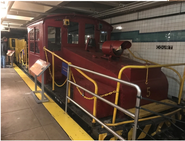
New York Transit Museum, Brooklyn, NY