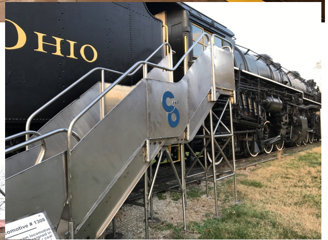
Railway Museum, Huntington, WV